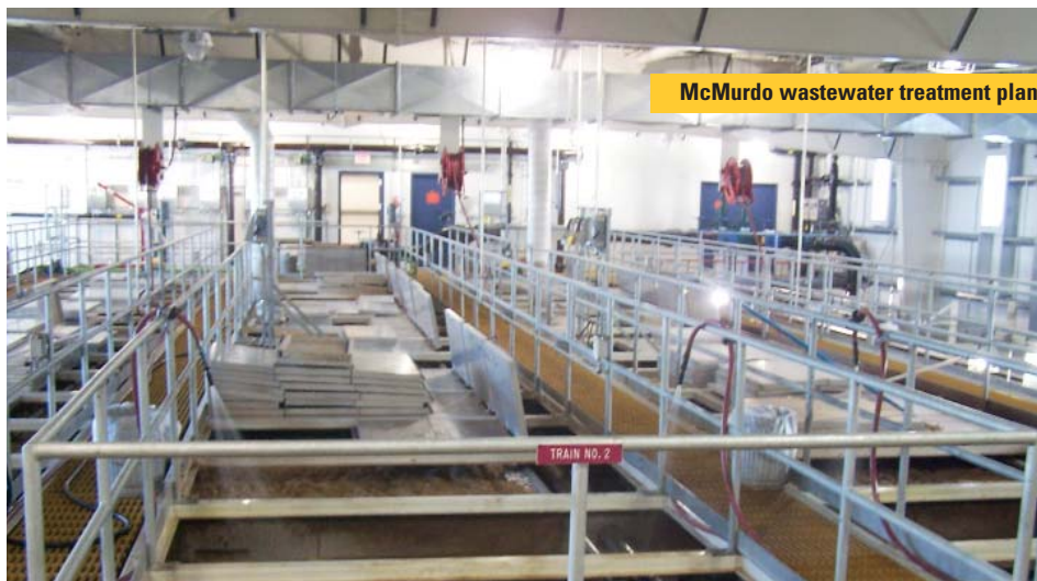
McMurdo wastewater treatment plant