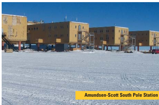
Amundsen-Scott South Pole Station