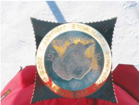
South Pole Marker – all directions point north