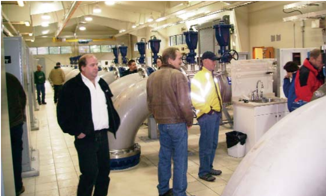
Inside the Capital Regional District Water Treatment UV Facility during a recent tour for BCWWA course students.