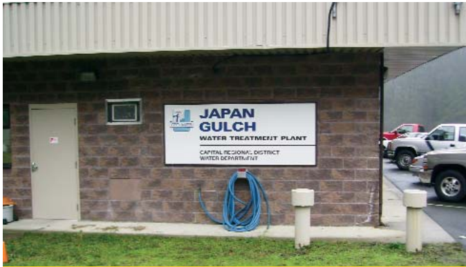
Capital Regional District Japan Gulch Water Treatment Facility Chloramination Building.