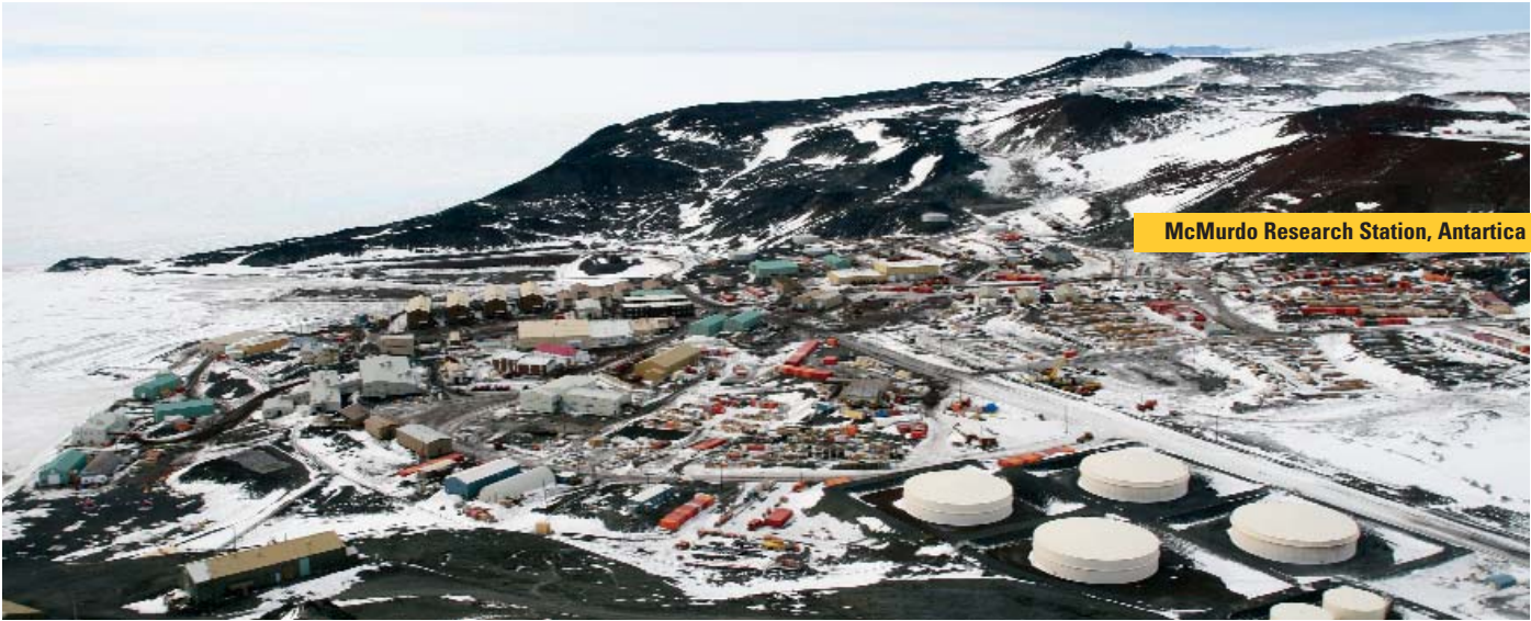
McMurdo Research Station, Antarctica